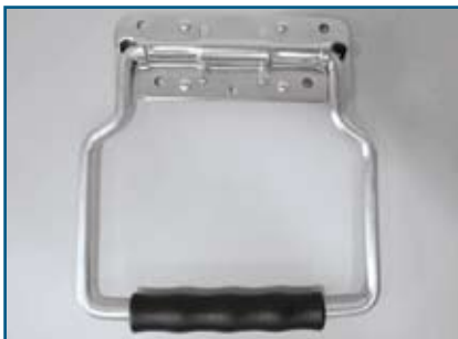
Pull-handle 400 123 Length: 175 mm Steel, zincod