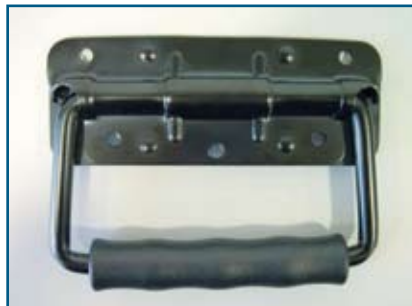
Handle 400 122 Steel, black Rubber grip: Ø 20 mm