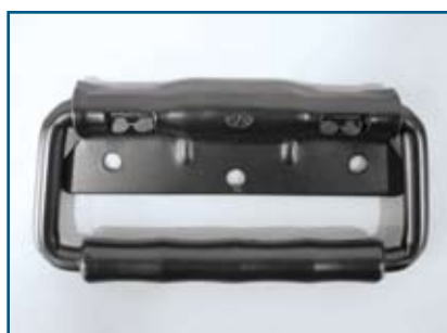
Handle 400 127 Steel, black Rubber grip: Ø 16 mm