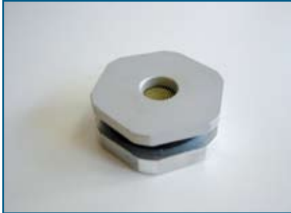
Pressure regulator 400 064