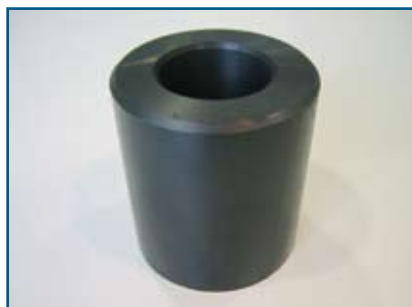
Pallet feet 400 050 Ø 100 mm, height: 100 mm