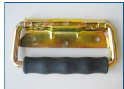
Handle 400 039 Steel, yellow zinc plated Rubber grip: Ø 20 mm