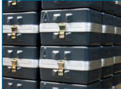
Moulded-in letters Special sizes Height of letters: up to 100 mm