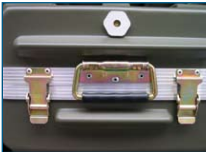
IP54 Watertight version according to protection degree IP54 (DIN EN 60529). Container is sealed additionally and equipped with a pressure regulator 400 064.