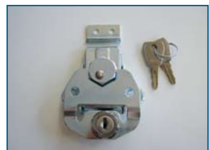
Art.-Nr. 400 077 Steel, zined lockable