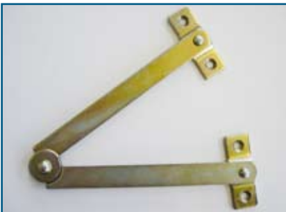
Lid stay 400 035 Big