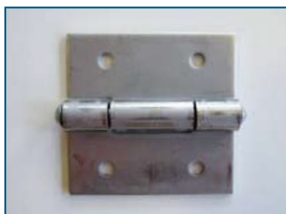
Hinge 400 012 Stainless steel 50 mm x 48 mm; \varnothing 4,2