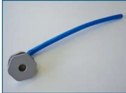
Pressure regulator 400 063 With flexible tube