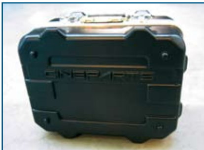
Moulded-in logos According to customer`s indications