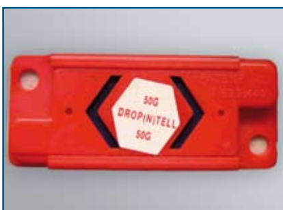
Shock indicator 400 115/400 116 Drop(N) Tell 25G/50G Shows improper treatment during the transportation