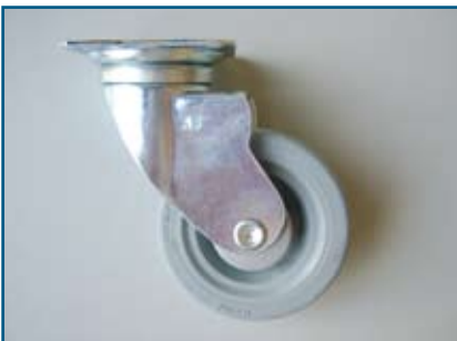
Swivel Castor 400 065 Ø 75 mm Save running load per piece: 50 kg