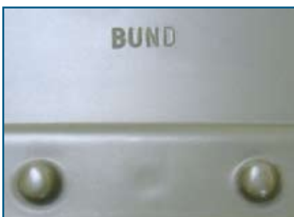
Stamping According to customer`s indications