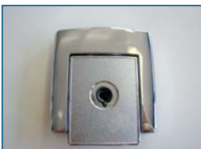
Suitcase Hasp 400 019 zined lockable