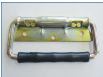
Handle 400 005 Steel, yellow zinc plated Rubber grip: Ø 14 mm