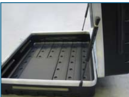
Gas springs Outside as well as inside the container mountable