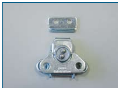
Butterfly Catch 400 053 Steel, zined