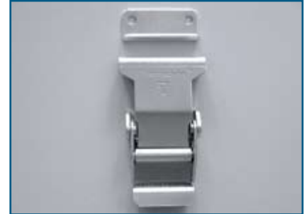
Catch 400 128 Steel, zined