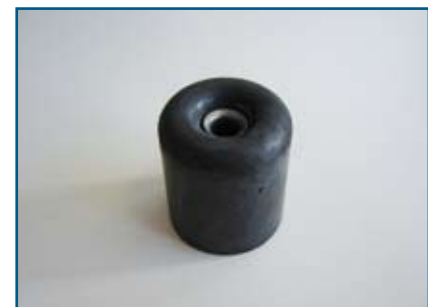
Rubber foot 400 055 (Several types)