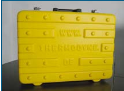
Moulded-in letters Standard size Capital letters, height: 30 mm