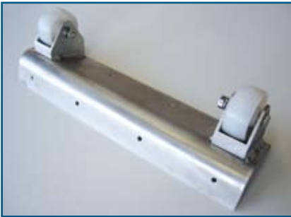
Transport Castor 400 085 Double castor Save running load per set: 80 kg