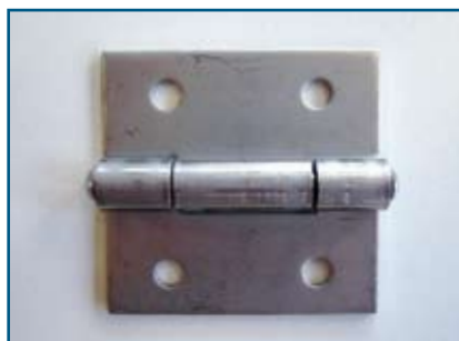
Hinge 400 011 Stainless steel 50 mm x 48 mm; \varnothing 5,2