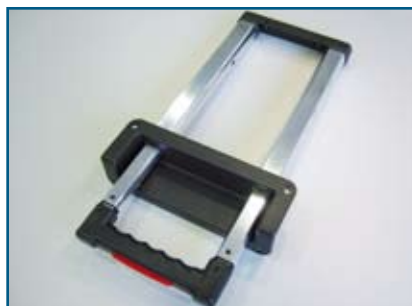
Pull-out-handle 400 118 Recessed 3 stages extendable