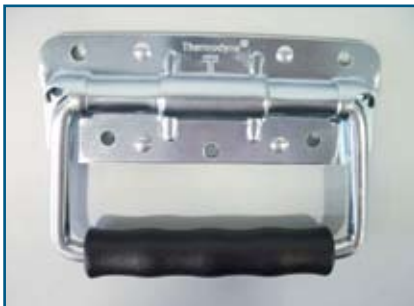
Handle 400 120 Steel, zinc plated Rubber grip: Ø 20 mm