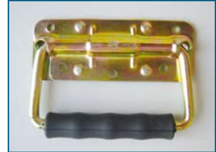
Handle 400 038 Steel, yellow zinc plated Rubber grip: Ø 20 mm