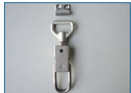
Catch 400 072 Stainless steel