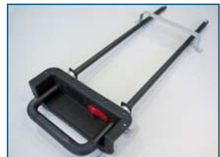
Pull-out-handle 400 040 Recessed 1 stage extendable