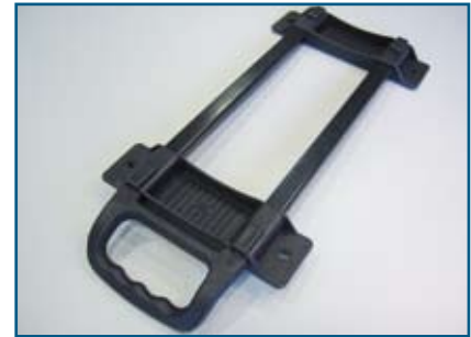
Pull-out-handle 400 090 1 stage extendable