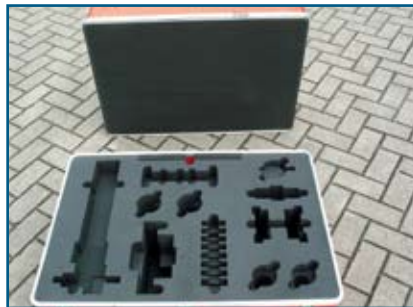
Removable lid All containers are available with removable lids.