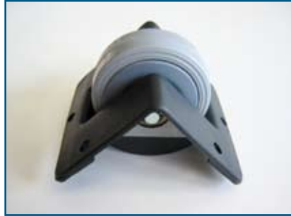
Wheel 400 033 Ø 50mm Save running load per set: 35 kg