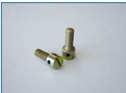
Sealing holder 400 029