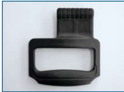
Pull-handle 400 089 Plastic, black