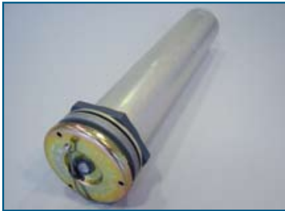
Records holder 400 041 Small Inside dimensions: Ø 43mm, length: 233 mm