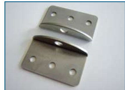
Padlock hasp 400 016