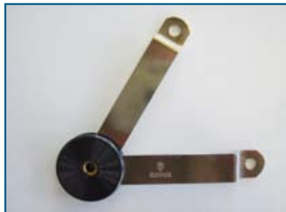
Lid stay 400 036 Small