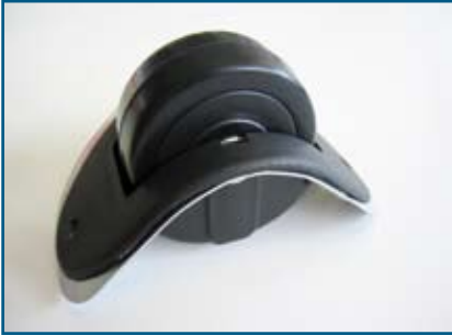
Wheel 400 026 Ø 50mm Save running load per set: 25 kg