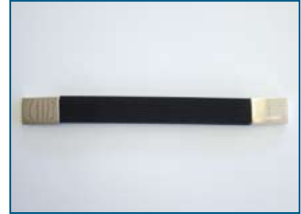
Strap handle 400 007 Plastic