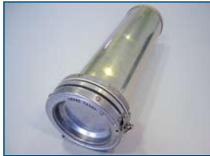
Records holder 400 042 Big Inside dimensions: Ø 85mm, length: 300 mm