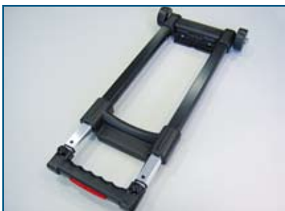
Pull-out-handle 400 091 With wheels 3 stages extendable