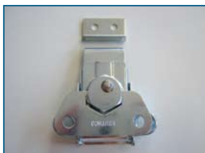
ART.-Nr. 400 074 Steel, zined