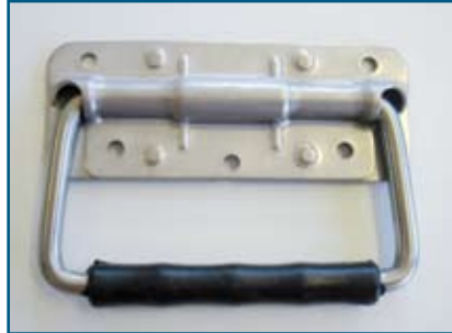
Handle 400 002 Stainless steel Rubber grip: Ø 14 mm