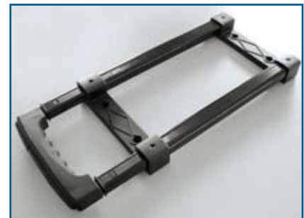
Pull-out-handle 400 110 2 stages extendable