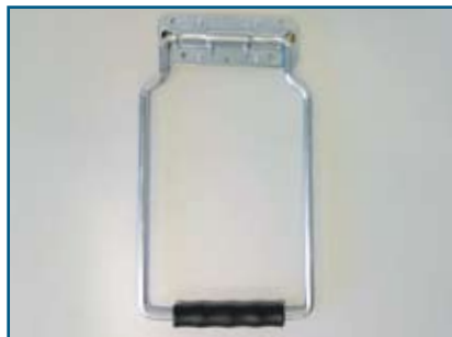
Pull-handle 400 124 Length: 245 mm Steel, zincod