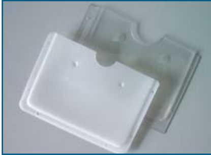
Art.-Nr. 400 096/400 133 Document holder A6 400 096: opaque 400 133: transparent