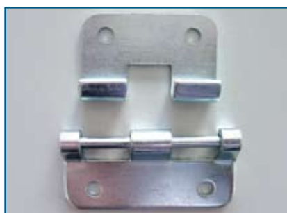
Hook over hinge 400 021 Steel, zined 58 mm x 48 mm