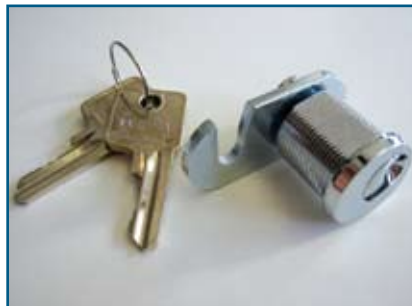
Security hasp 400 017 Chromium plated