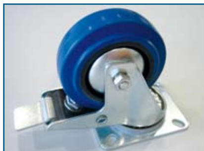
Swivel Castor 400 101 Ø 100 mm With brake Save running load per piece: 50 kg