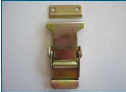
Catch 400 022 Steel, yellow zined