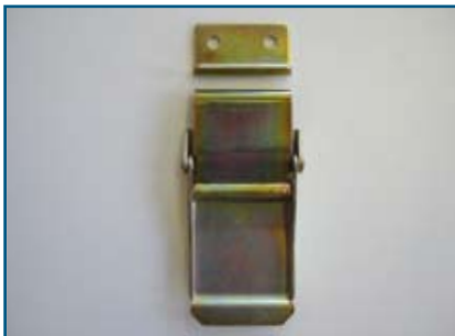
Catch 400 024 Steel, yellow zined