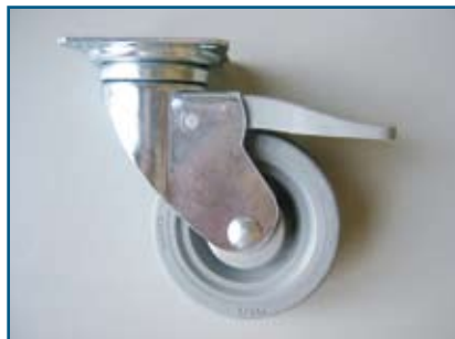
Swivel Castor 400 066 Ø 75 mm With brake Save running load per piece: 50 kg