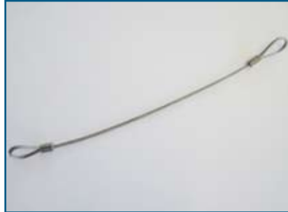
Wire lid stay 400 031 Stainless steel