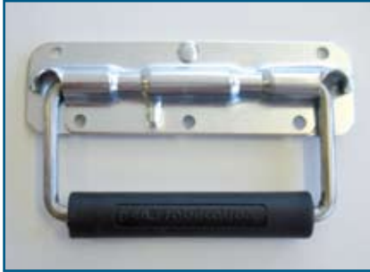
Handle 10 53 Steel, zincod Rubber grip: Ø 19 mm