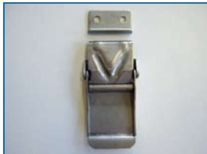
Catch 400 025 Stainless steel