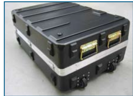
Trolley version Nearly all containers can be delivered as a Trolley. Depending on the dimensions of the container and the conditions it is in use, different wheels, pull-handles and pull-out handles are available.