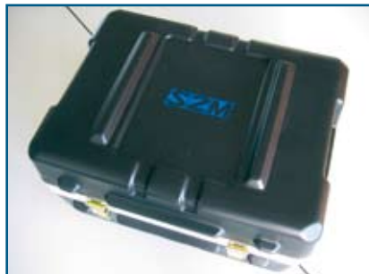
Screenprint According to customer`s indications