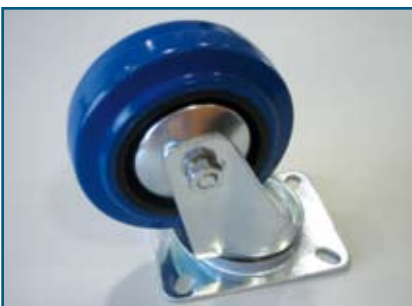
Swivel Castor 400 100 Ø 100 mm Save running load per piece: 50 kg