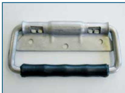
Handle 400 009 Stainless steel Rubber grip: Ø 14 mm