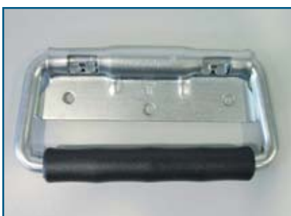
Handle 400 125 Steel, zinc plated Rubber grip: Ø 16 mm