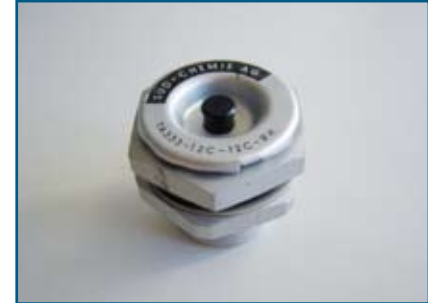
Pressure regulation valve 400 043 With push button