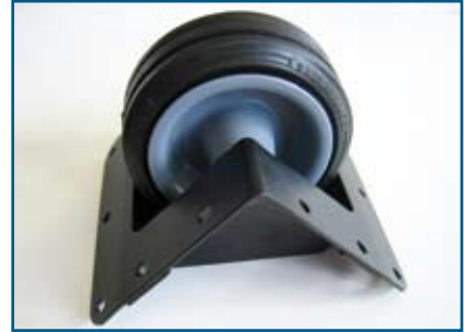
Wheel 400 034 Ø 80mm Save running load per set: 80 kg