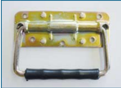
Handle 400 001 Steel, yellow zinc plated Rubber grip: Ø 14 mm