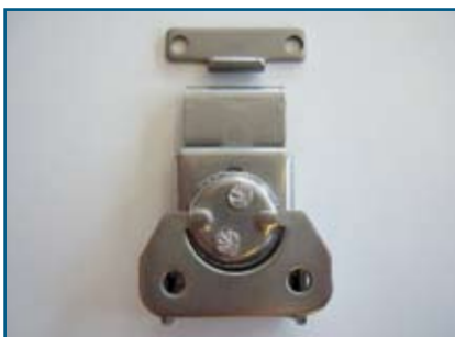
Butterfly Catch 400 051 Stainless steel