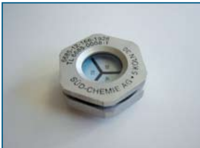
Humidity indicator 400 044