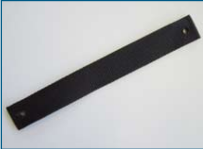
Webbing lid stay 400 010 PP webbing