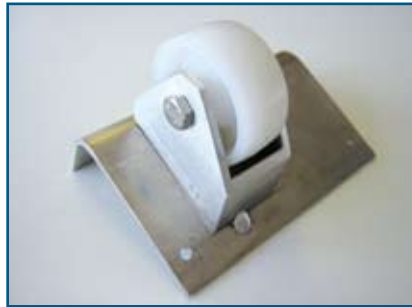
Transport Castor 400 085 E Single castor Save running load per set: 80 kg