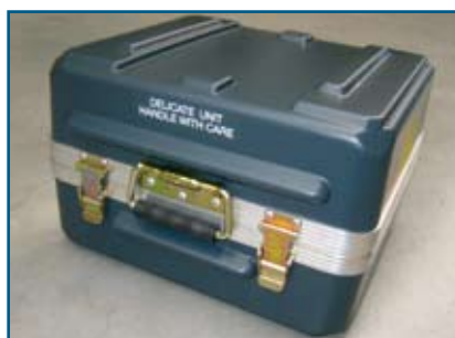
Lables According to customer`s indications