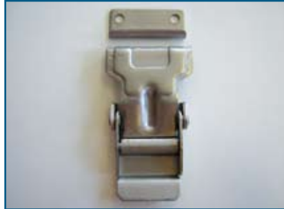
Catch 400 023 Stainless steel