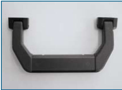
Handle 400 015 Plastic, black