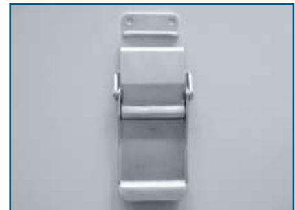
Catch 400 132 Steel, zined