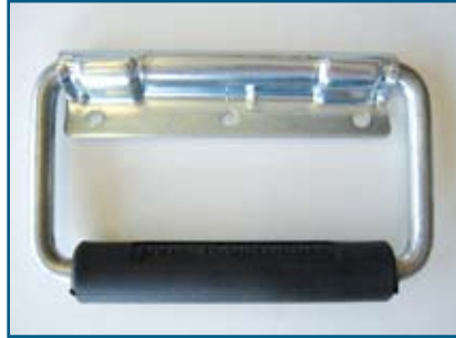
Handle 10 78 Steel, zincod Rubber grip: Ø 19 mm