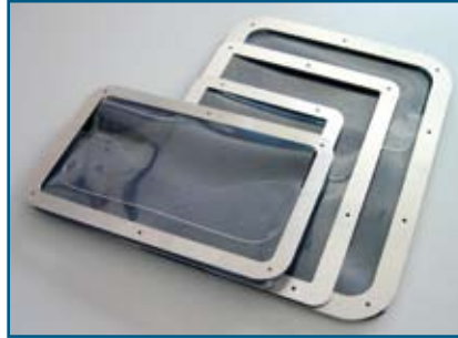
Document pockets 4 versions (s. to the right):