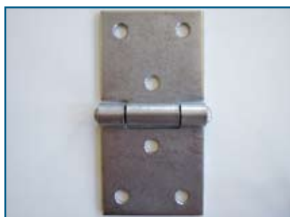
Hinge 400 013 Stainless steel 50 mm x 100 mm